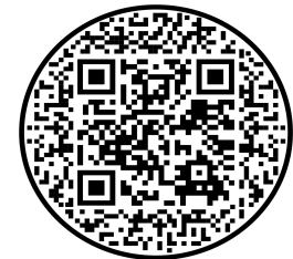
Family Self-Sufficiency Program